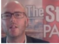
Siemens' Bid for Dresser-Rand Could...