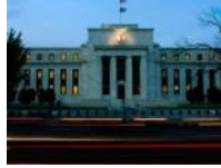
Fed Likely to Signal Rate Hike on Track Despite...