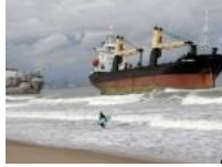
Mari-Time For Reform? - Beyond the Occasional...