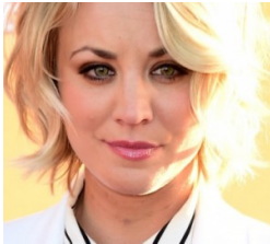
(http://www.zergne 6 Reasons Kaley