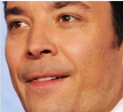
(http://www.zergne The Shady Side Of Jimmy Fallon You Don't See On Camera (http://www.zergn