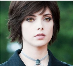
(http://www.zergne 6 Celebs Who