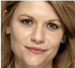
(http://www.zergne 7 Celebrities Who Can't Stop Cheating (http://www.zergn